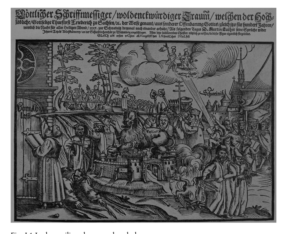
Fig. I.1 Luther nailing theses to church door.

only the great distance—theologically and chronologically speaking—between them and us but also the iconographic place reserved for them in our collective memory: An angry (or desperate) young friar, hammer in hand (or, in early depictions, a quill), nailing (or writing) the 95 Theses on the Castle Church door in Wittenberg on 31 October 1517. And when, beginning fifty years ago, reputable scholars began to question whether the theses had been posted at all, it seemed to some that the Reformation itself had been called into question. This introduction will help situate these documents within the late-medieval milieu in which Luther grew up and worked and demonstrate why, for a surprising variety of reasons, these three documents really were the spark for the firestorm of reform that followed.