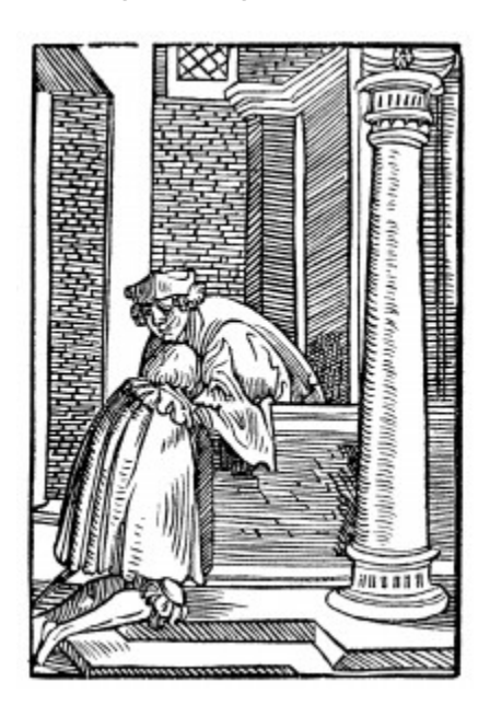
Fig. I.2 Medieval Penance.

of sin into a state of grace. This sacrament had the advantage of being repeatable, but it was not as powerful as baptism. While it also took away the guilt ( culpa ) of sin, it only reduced the punishment ( poena ) from an eternal punishment to a temporal one. A forgiven Christian in a state of grace could then satisfy this remaining temporal punishment, usually by performing the three good works defined by Christ in the Sermon on the Mount (prayer, fasting, and almsgiving), from which a myriad of other works were derived. These good works helped to mortify the flesh, restraining its evil impulses while giving honor to God and helping the neighbor.